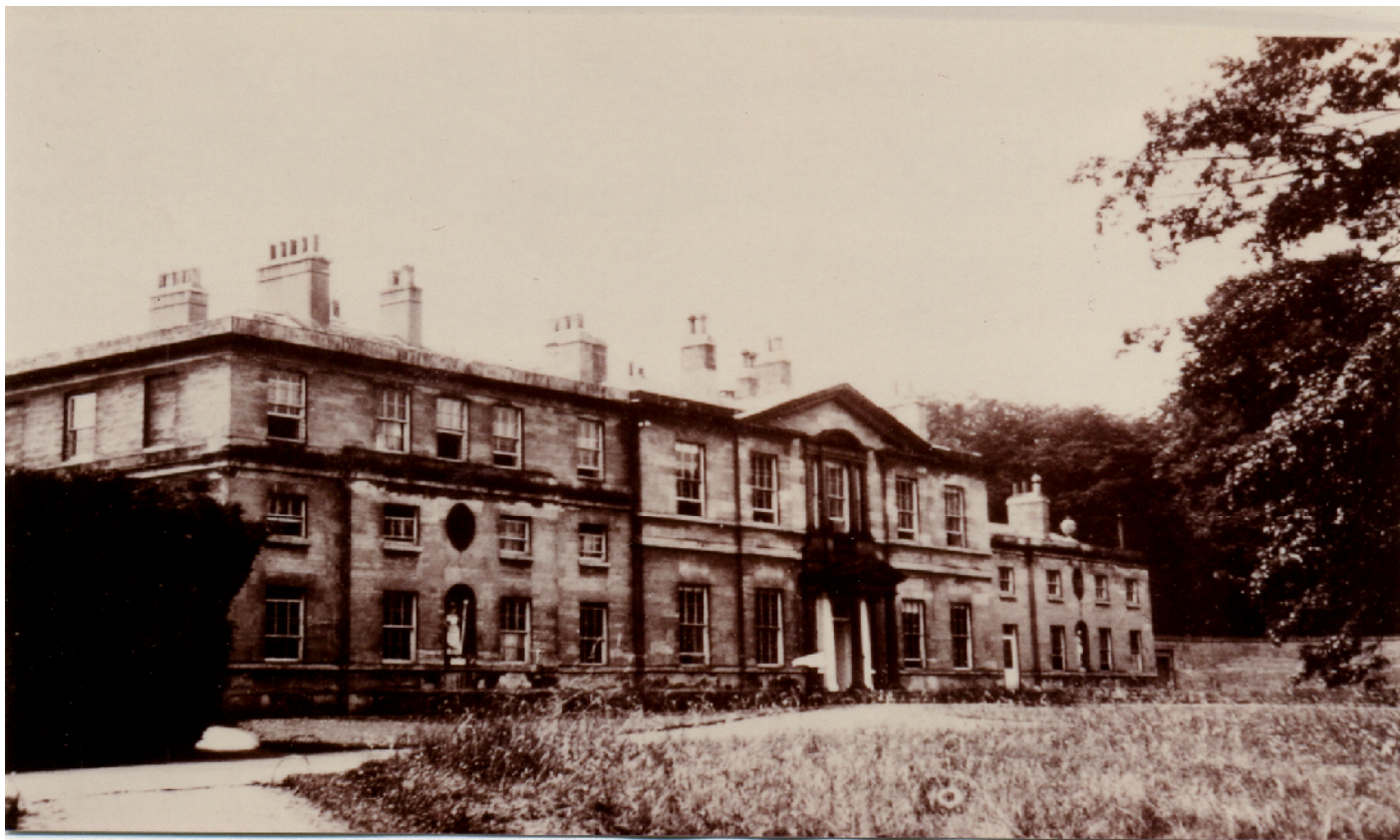
Bowcliffe Hall. See book page 95.